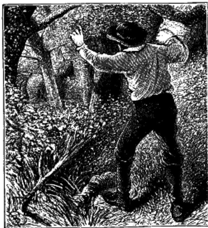
"THE LAST I EVER SAW OF HIM."