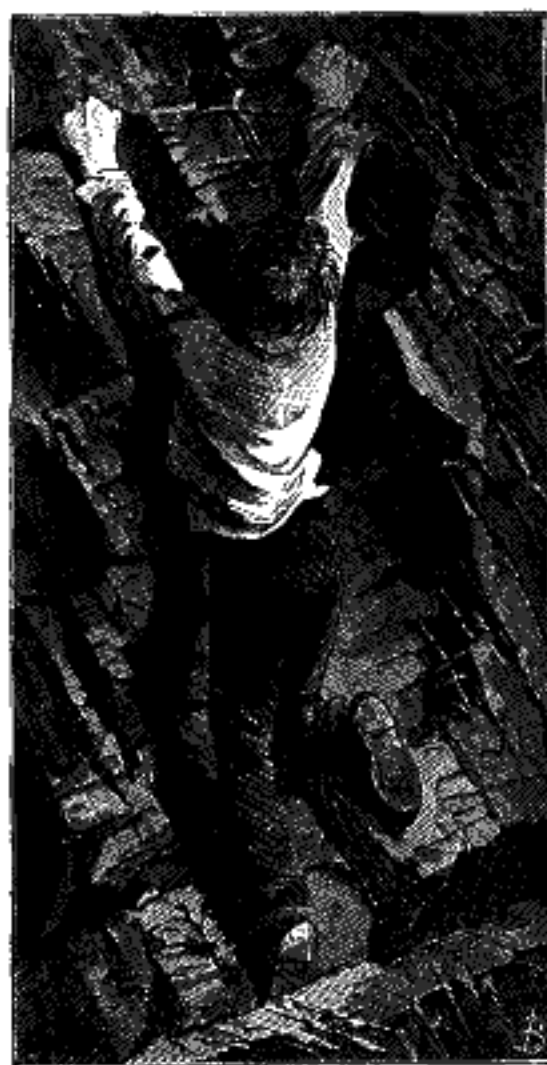
DESCENDING THE PRECIPICE.

Soon after leaving "Tower Falls," I entered the open country. Pine forests and windfalls were changed for sage brush and desolation, with occasional tracts of stunted verdure, barren hillsides, exhibiting here and there an isolated clump of dwarf trees, and ravines filled with the rocky débris of adjacent mountains. My first camp on this part of the route, for the convenience of getting wood, was made near the summit of a range of towering foot-hills. Towards morning a storm of wind and snow nearly extinguished my fire. I became very cold; the storm was still raging when I arose, and the ground white with snow. I was perfectly bewildered, and had lost my course of travel. No visible object, seen through the almost blinding storm, reassured me, and there was no alternative but to find the river and take my direction from its current. Fortunately, after a few hours of stumbling and scrambling among rocks and over crests, I came to the precipitous side of the cañon through which it ran,