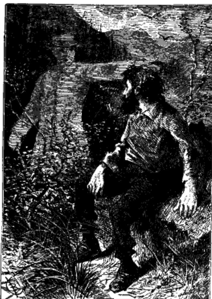
THE GHOSTLY COUNSELLOR.

"Doctor, I am rejoiced to meet you in this hour of distress, but doubt the wisdom of your counsel. I am within seventy miles of Virginia. Just over these rocks, a few miles away, I shall find friends. My shoes are nearly worn out, my clothes are in tatters, and my strength is almost overcome. As a last trial, it seems