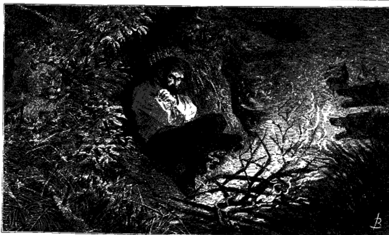
A NIGHT OF TERROR.

one hundred miles or more to Eagle Rock bridge; another, to cross the country between the southern shore of Yellowstone Lake and the Madison Mountains, by scaling which I could easily reach the settlements in the Madison Valley; and the other, to retrace my journey over the long and discouraging route by which I had entered the country. Of these routes the last-mentioned seemed the least inviting, probably because I had so recently traversed it, and was familiar with its difficulties. I had heard and read so much concerning the desolation and elemental upheavals and violent waters of the upper valley of the Snake, that I dared not attempt to return in that direction. The route by the Madison Range, encumbered by the single obstruction of the mountain barrier, was much the shortest, and so, most unwisely as will hereafter appear, I adopted it.