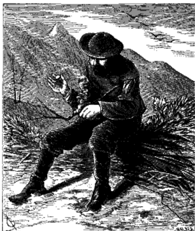
THE FIRST FIRE.

from the company, but I now made a convenient substitute by sharpening the tongue of a buckle which I cut from my vest. With this I cut the legs and counters from my boots, making of them a passable pair of slippers, which I fastened to my feet as firmly as I could with strips of bark. With the ravelings of a linen handkerchief, aided by the magic buckle-tongue, I mended my clothing. Of the same material I made a fish-line, which, on finding a piece of red tape in one of my pockets better suited to the purpose, I abandoned as a "bad job." I made of a pin that I found in my coat a fish-hook, and, by sewing up the bottoms of my boot-legs, constructed a very good pair of pouches to carry my food in, fastening them to my belt by the straps.