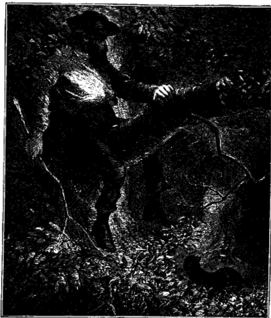
THE MOUNTAIN LION.

I was roused from this train of reflections